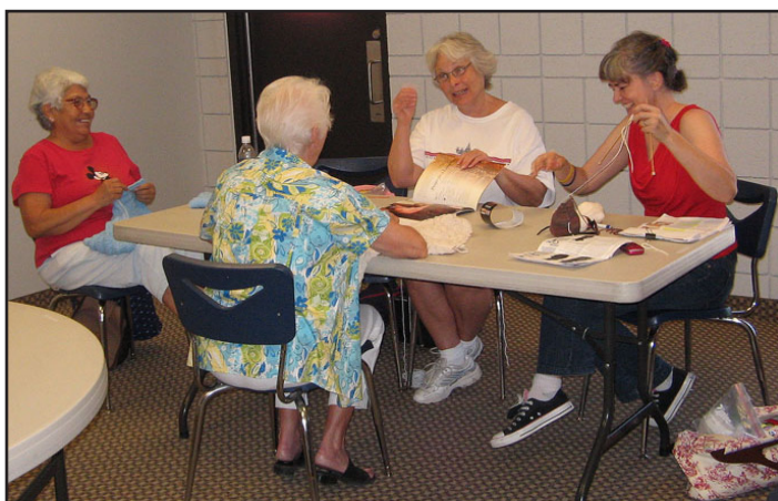
A few of our "Stitches" enjoying their projects and each other.