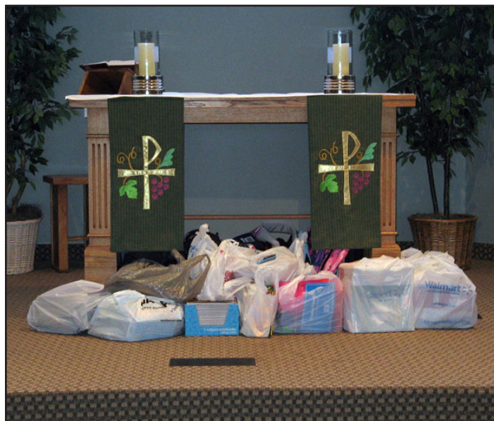
A portion of the school supplies donated during Spirit of Hope's Back-To-School Drive in August.